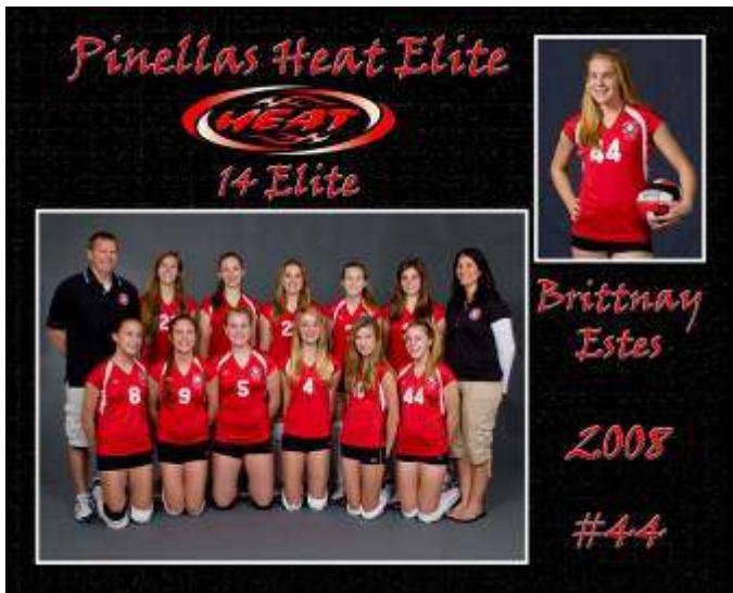
Ex. Of Sportsmate Collage