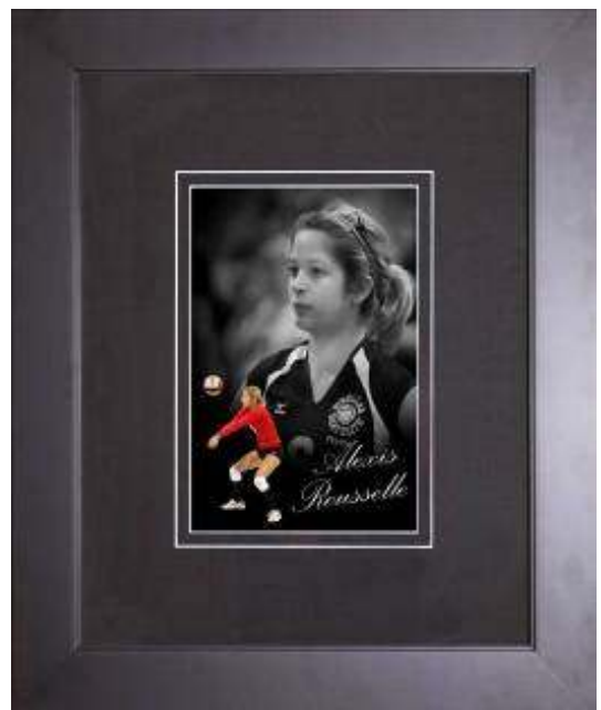
Ex. Of Legend Print - Framed