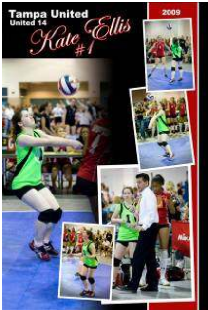
Ex. Of Poster Collage 1.