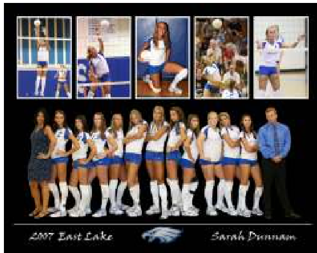
Ex of Poster Collage 3